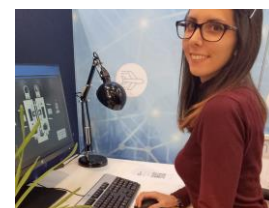
Universitat Politècnica de València in the E-WORLD Innovation Fair

Universitat Politècnica de València participated in the E-WORLD Innovation Fair and through its booth communicated 5GENESIS objectives and characteristics to industrial companies related to energy and water management services.