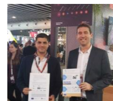
Nemergent Solutions participated in MWC 2019

Nemergent Solutions participated in MWC 2019 with a booth in the Spanish pavilion where besides its technology and mission critical solutions, the 5GENESIS project was presented and introduced to interested customers and vertical users.