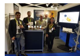
Nemergent Solutions participated in BAPCO 2019 and CCE 2019

Nemergent Solutions participated in BAPCO 2019 and CCE 2019 with a booth where besides its technology and mission critical solutions, the 5GENESIS project was presented and introduced to interested customers and vertical users.